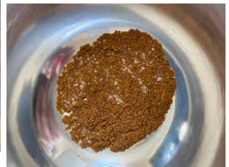
Garam masala & salt combined