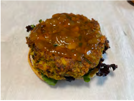
Assembly of chapli burger