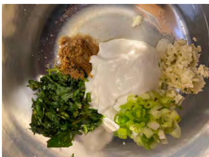
Ingredients in bowl