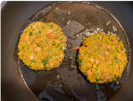
Formed patties searing off in pan