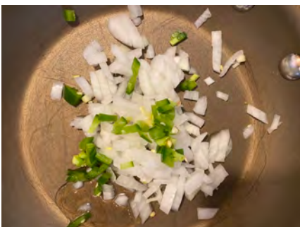
Onions and jalapenos in pan