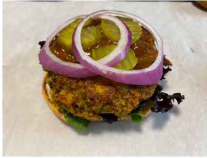
Onions and pickles added