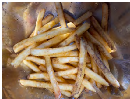
Fries tossed with salt and garam masala