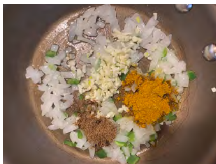
Garlic and spices added