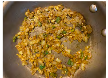
Onion mixture, done