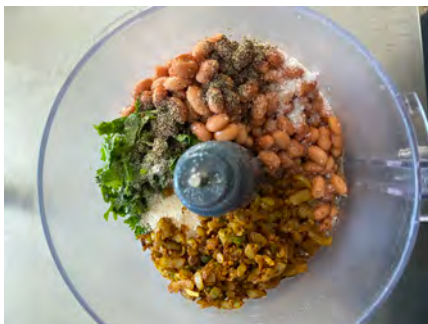
Ingredients in food processor