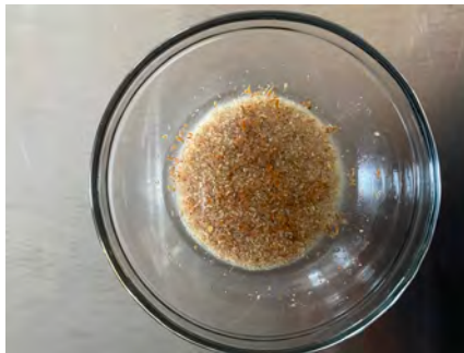
Flaxseed mixture after 5 minutes