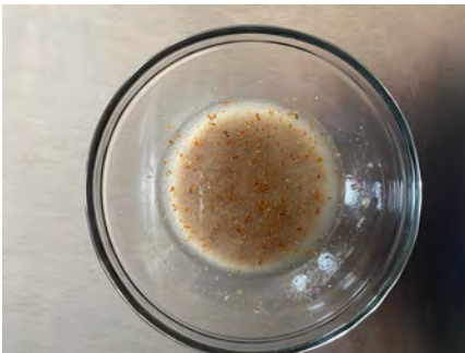
Water and flax seed