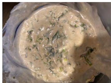
Mint & cumin mayo combined