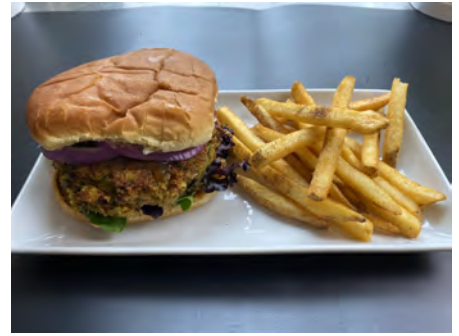
Final- Chapli Burger w Masala Fries